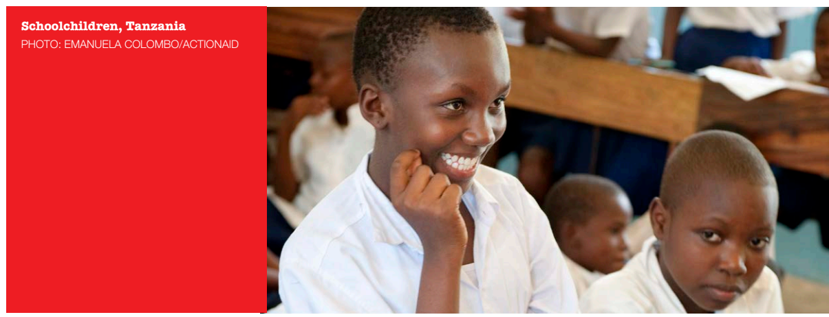
Schoolchildren, Tanzania PHOTO: EMANUELA COLOMBO/ACTIONAID

Source: UNESCO, Who Pays for What In Education?: The real costs revealed through national education accounts , 2016, p.8, http://uis.unesco.org/sites/default/files/documents/who-pays-for-what-in-education-national-revealed-through-accounts-2016-en_0.pdf